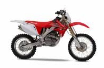
CRF 250 + $0.00