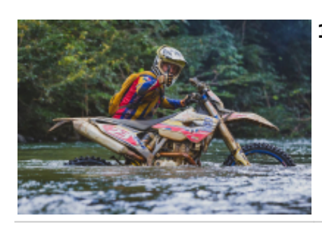
1 - Bogota - Villa de Leyva - 0