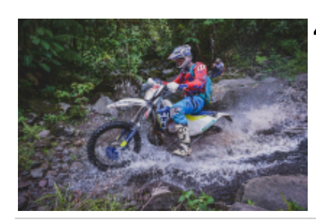
4 - Pacho - Villeta - 130