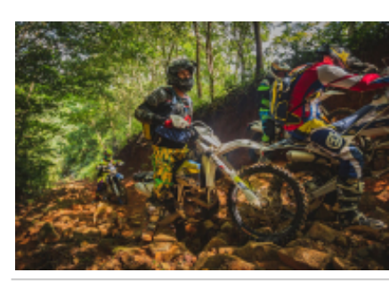
2 - Villa de Leyva - Ubaté - 100