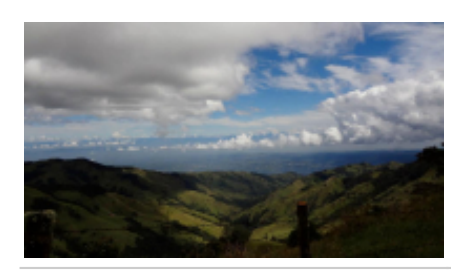
3 - Ubaté - Pacho - 140