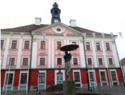
10 - Pärnu - Tallinn -