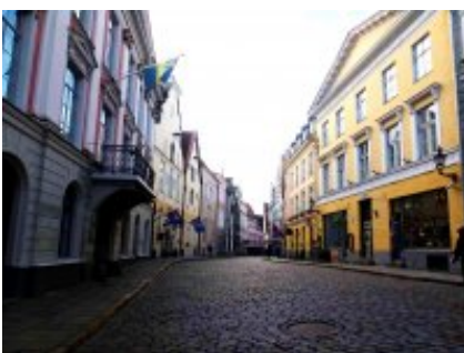
11 - Tallinn - Tallinn -