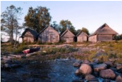
9 - Commune de Varbla - Pärnu - 70