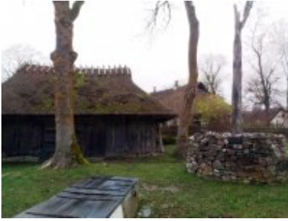
7 - Kuressaare - Koguva - 78