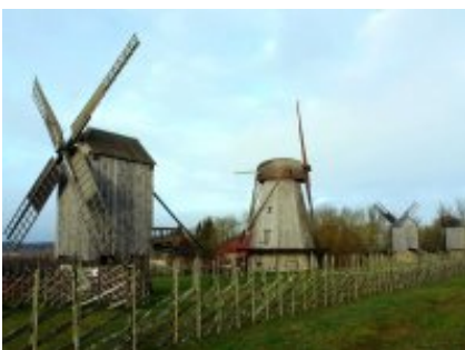
6 - Saaremaa - Kuressaare - 51