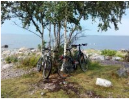
8 - Koguva - Commune de Varbla - 51