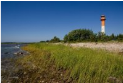
4 - Haapsalu - Kardla - 38