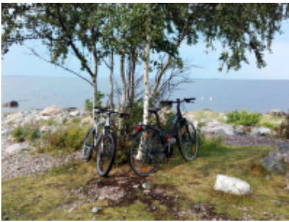
8 - Koguva - Commune de Varbla - 51