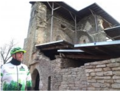
3 - Padise - Haapsalu - 55