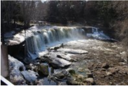
2 - Tallinn - Padise - 65