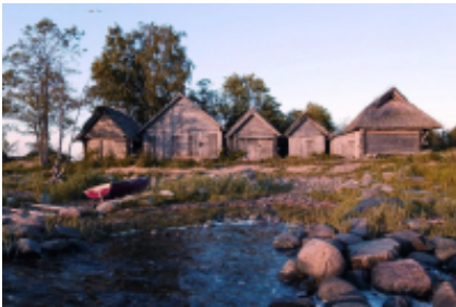
9 - Commune de Varbla - Pärnu - 70