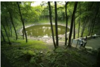
5 - Kardla - Saaremaa - 58