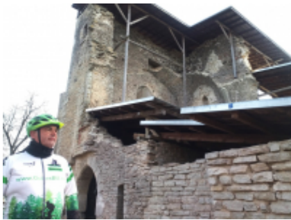
3 - Padise - Haapsalu - 55