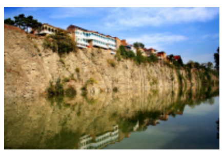
10 - Tbilissi - Tbilissi - 0