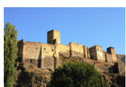
9 - - Tbilissi - 18