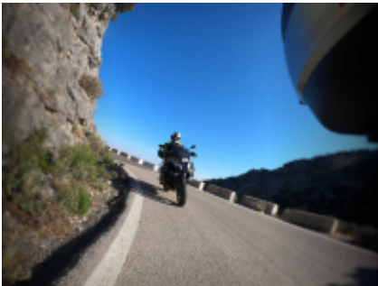
8 - Málaga - Málaga - 0