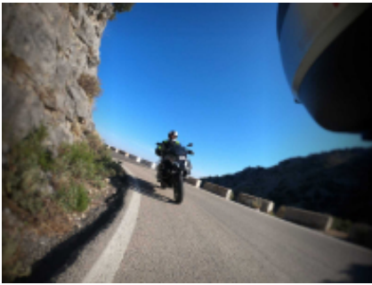
8 - Málaga - Málaga - 0