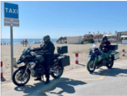
7 - Ronda - Málaga - 181