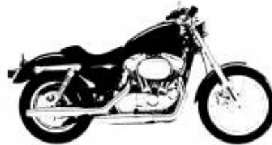
Scrambler Desert X 800 + $0.00