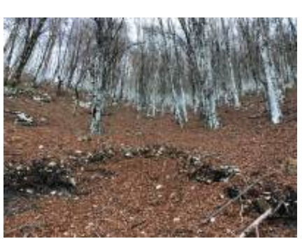
6 - Sibiu - - 0