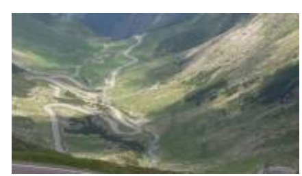
3 - Sibiu - Sibiu - 90