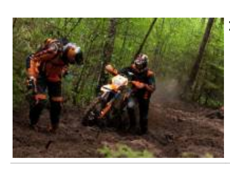
1 - - Sibiu - 0