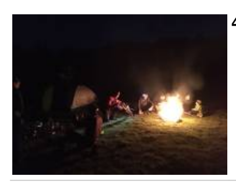
4 - Sibiu - Sibiu - 150