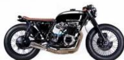
CB 500 Cafe Racer + $0.00