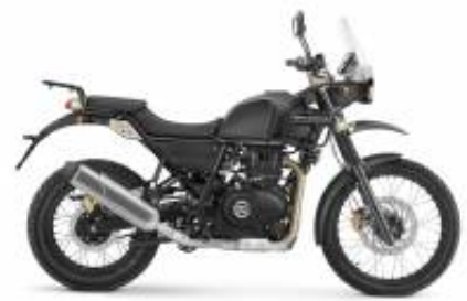
Himalayan 411 + $110.22