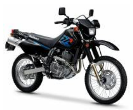
DR 650 + $678.00