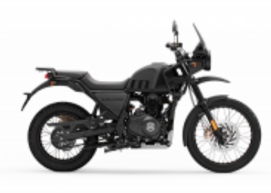
Himalayan 400 + $510.00