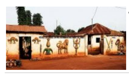
4 - Ouidah - Abomey - 170 km