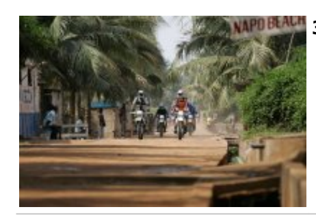
3 - Ouidah - Ouidah - 120 km