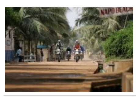
🌉 6 - Atakpame - Badou - 150 km