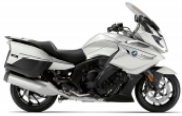
K 1600 GTL + $567.76