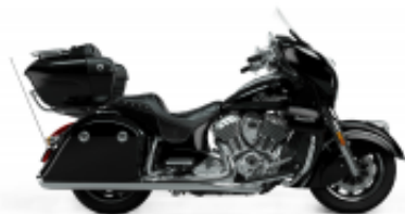
Roadmaster 1890 Grand Touring Class + $546.96