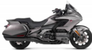
Goldwing DCT 2018 + $567.76