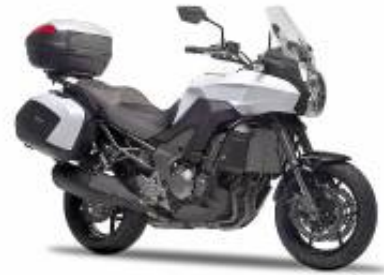
Versys 1000 Grand Tourer + $535.31