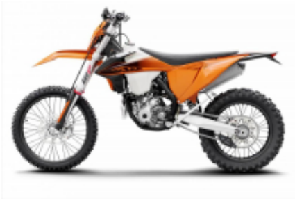
TPI/Six Days 300 + £0.00