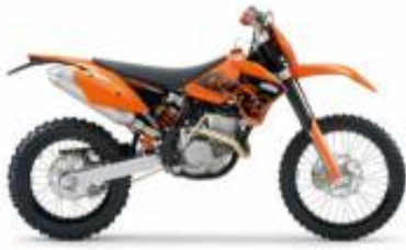
EXC 250 + £0.00