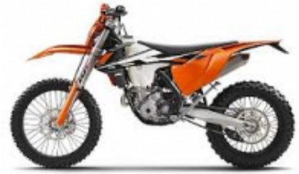
EXC 350 + £0.00