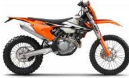
EXC 450 + £0.00