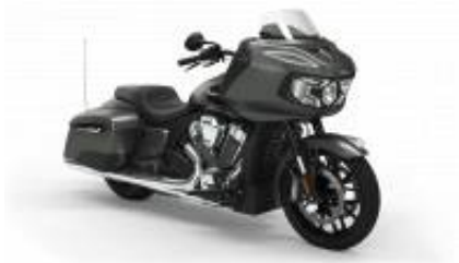
Challenger Street Touring Class + $390.00