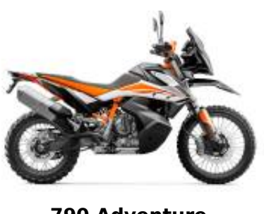
790 Adventure + $797.75