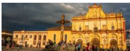
2 - Puebla - Coatzacoalcos - 471 Puebla - Coatzacoalcos