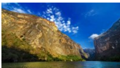
6 - Las Nubes - Palenque - 364 Las Nubes - Yaxchilan - Palenque