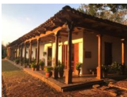
3 - Coatzacoalcos - Palenque - 311 Coatzacoalcos - Palenque