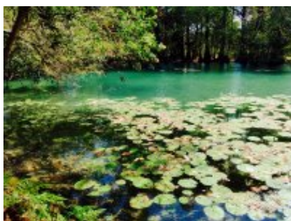
5 - San Cristobal de las Casas - Las Nubes - 216 San Cristobal - Las Nubes