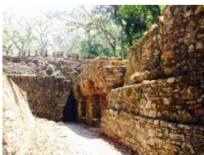
4 - Palenque - San Cristobal de las Casas - 213 Palenque - San Cristobal