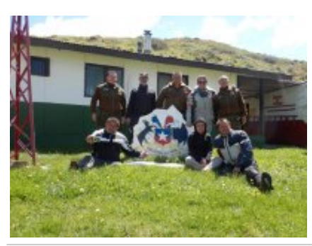
17 - Punta Arenas - Punta Arenas - RETURN