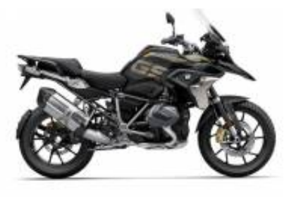
R 1250 GS LC + $790.00