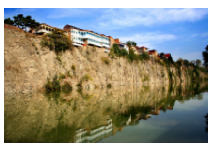
10 - Tbilisi - Tbilisi - 0 In the morning, departure to the airport for home.