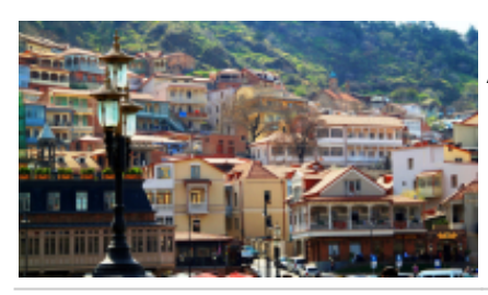
1 - Tbilisi - Tbilisi - 0

Arrival at Tbilisi International Airport and transfer to the hotel.