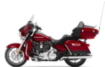
Electra Glide Ultra Touring Class + $0.00