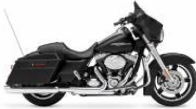
Street Glide + $0.00