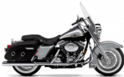
Road King + $0.00