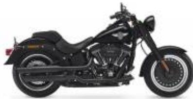
Fat Boy + $0.00