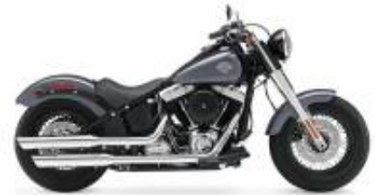
Heritage Softail Classic + $0.00