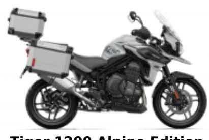
Tiger 1200 Alpine Edition + $2,223.94