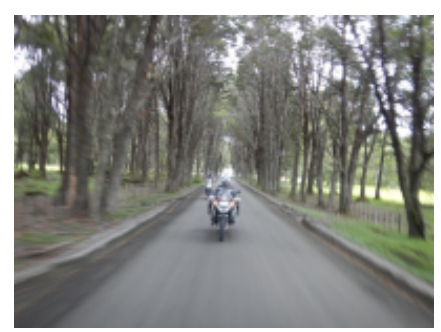
8 - Lago Posadas - El Calafate - 565

A short but intense day awaits us. We will follow the Baker River, which impresses with its intense turquoise color and enormous flow. We will leave the pristine nature of the Carretera Austral to cross into Argentina through the Roballos Pass, where we will cross the Chacabuco Valley (Patagonia National Park) to arrive in the afternoon at the hotel in the small town of Lago Posadas and visit its beautiful Stone Arch.