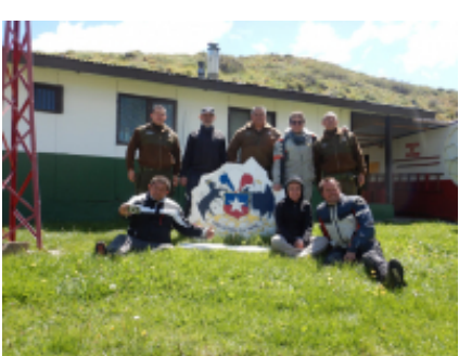
10 - El Calafate - Puerto Natales - 387

If you wish, you can join us to visit the Los Glaciares National Park, a UNESCO World Heritage site, and be amazed by the impressive Perito Moreno Glacier.