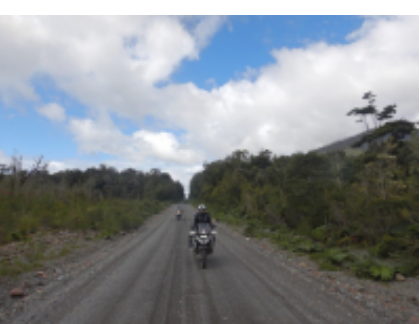
7 - Puerto Guadal - Lago Posadas - 187