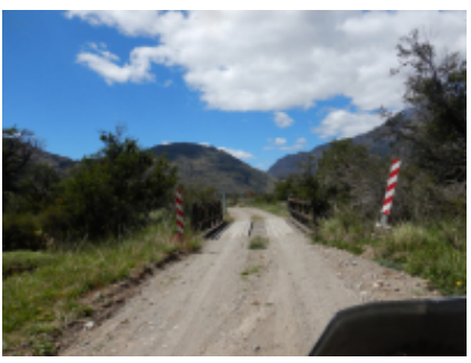
9 - El Calafate - Perito Moreno - 140

A long day awaits us! We will descend along the legendary Route 40, through the desertic Patagonian steppe, between turquoise-colored lakes and rivers. We will enjoy sightings of numerous guanacos and perhaps have the chance to see ñandús, armadillos, and foxes. In the afternoon, we will arrive at a beautiful hotel near Lake Argentino, where we can rest and appreciate the city of El Calafate.