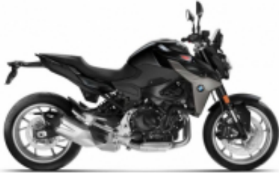
F 900 R + $52.77