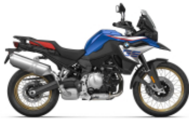
F 850 GS + $2,019.67