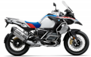
R 1250 GS Adventure + $870.62