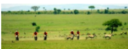
7 - Loyk Mara Camp - Maji Moto - 180 km