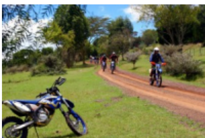
6 - Maasai Mara National Reserve - Loyk Mara Camp - 120 km