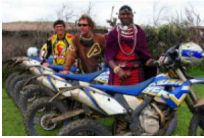
1 - Nairobi - Nairobi - 0 km