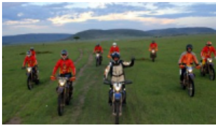
2 - Nairobi - Soysambu - 220 km