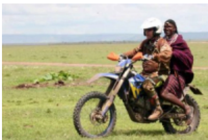
4 - Kericho - Maasai Mara National Reserve - 220 km