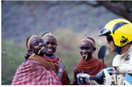
8 - Maji Moto - Nairobi - 140 km