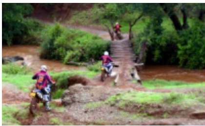
3 - Soysambu - Kericho - 200 km