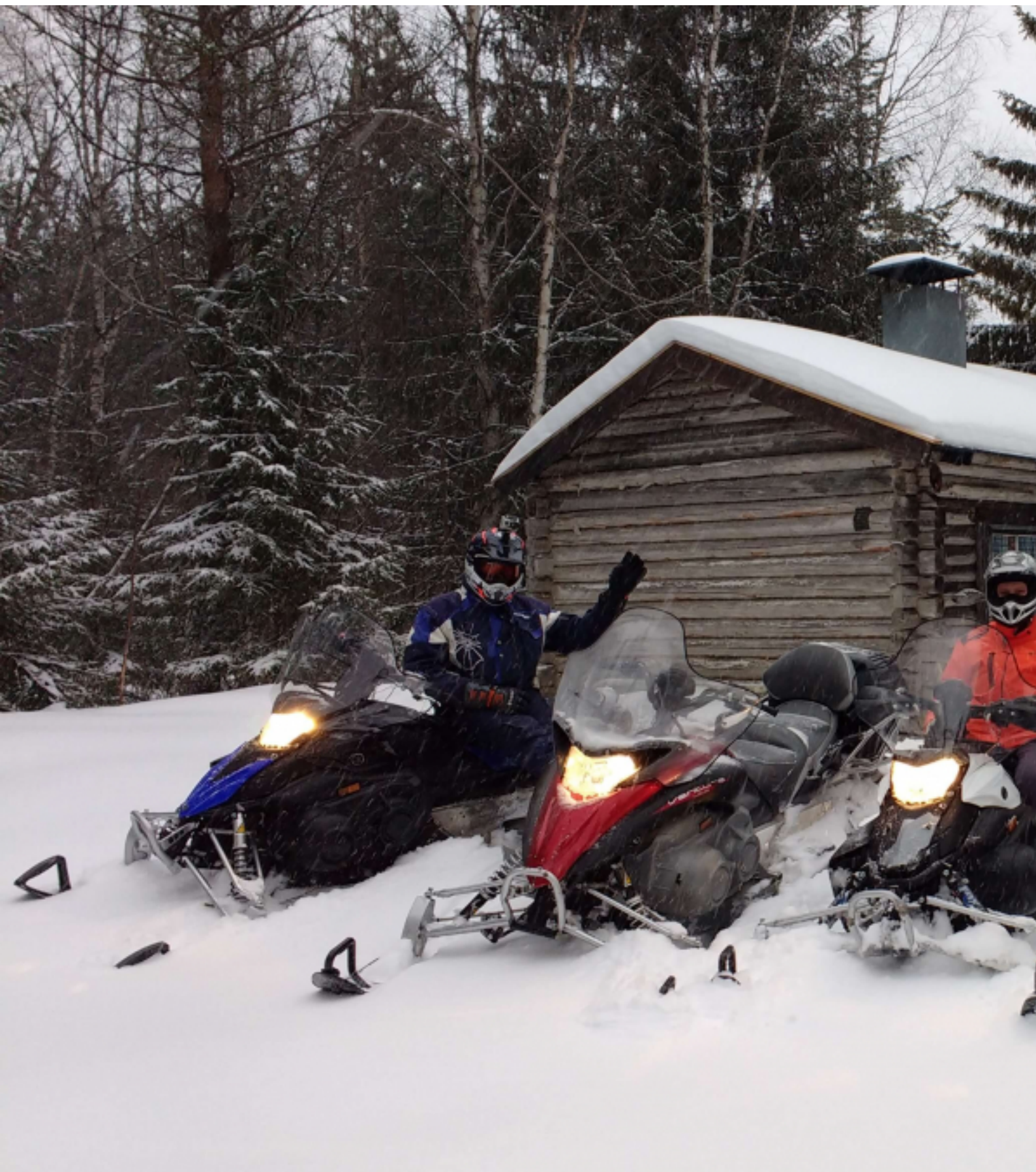
Snowmobile tour Sweden Polar circle