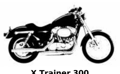
X Trainer 300 + $547.98