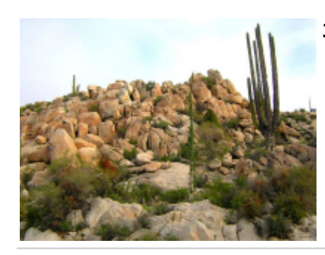
3 - Ensenada - Cataviñá - 370