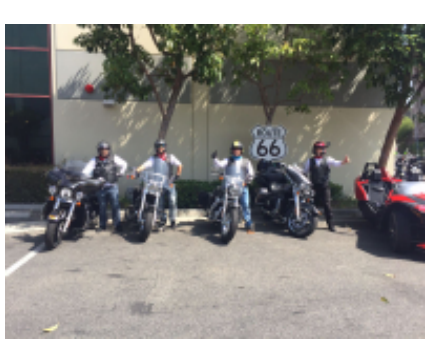
6 - Loreto - La Paz - 360