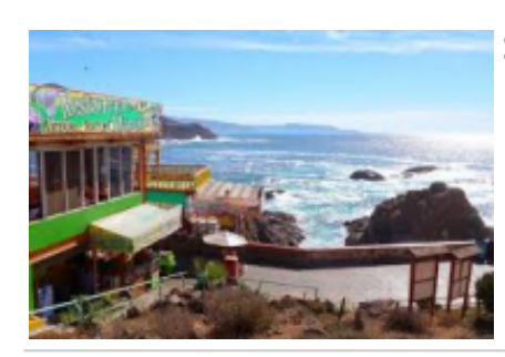
2 - Los Angeles - Ensenada - 341