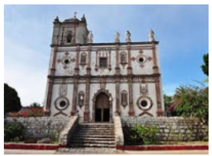
4 - Cataviñá - San Ignacio - 613