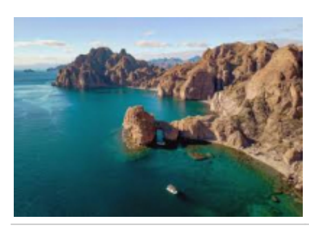
5 - San Ignacio - Loreto - 275