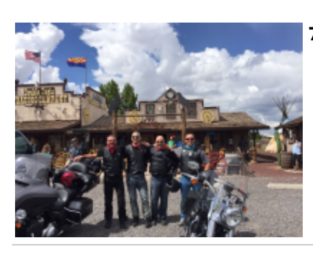
7 - La Paz - Cabo San Lucas - 215