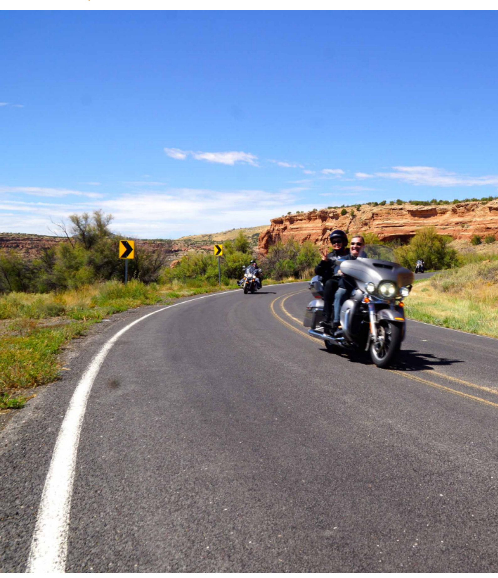
Viaggio in moto custom USA itinerario Bassa California con guida