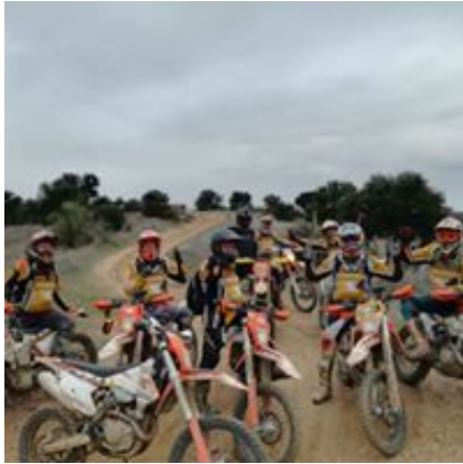
1 - Lisboa - Abela - 0