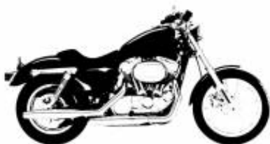
5 - Vila Nova de Milfontes - Abela - 170