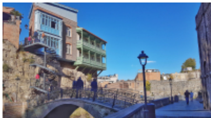
1 - Tbilisi - -