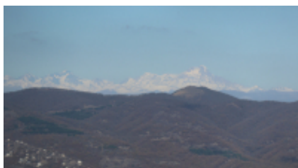
4 - Omalo - Omalo - 60-80