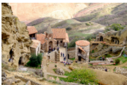
6 - Sighnaghi - Tbilisi - 160