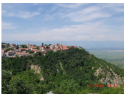
5 - Omalo - Sighnaghi - 120