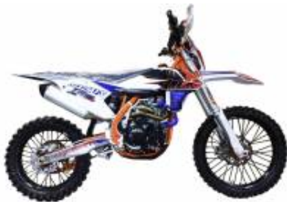
Sixdays 450 + R$ 0,00