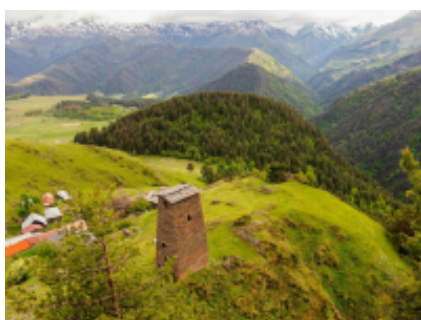
3 - Mtskheta-Mtianeti - Omalo - 140