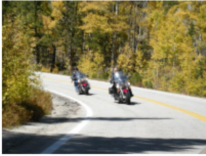
1 - Aeroporto - Calgary - 25