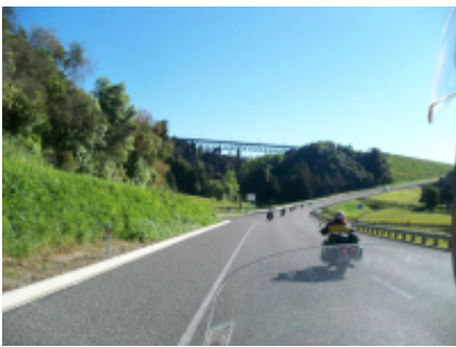
4 - Nelson - Kelowna - 392