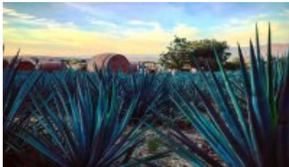
3 - Morelia - Tequila -