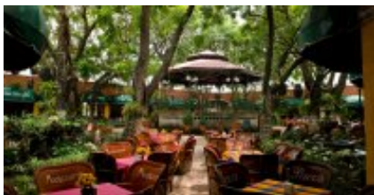
4 - Tequila - Sayulita -