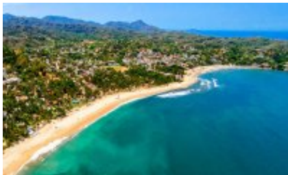
5 - Sayulita - Circuito Sayulita -