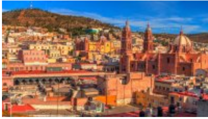
1 - Città del Messico - Valle de Bravo -