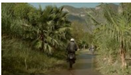
6 - Sayulita - Tlaquepaque -