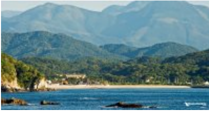
8 - Zacatecas - Guanajuato -