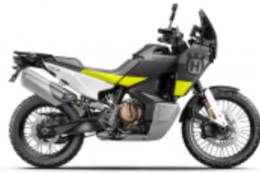
Norden 901 + $0.00