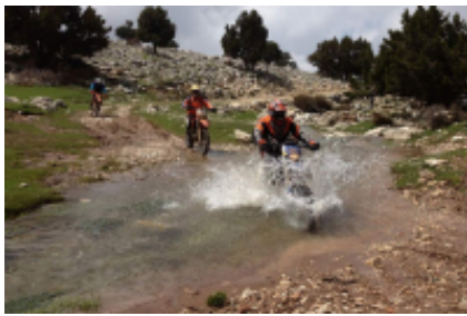
3 - Elmalı - Olympos - 180