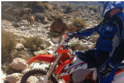
4 - Olympos - Kaş - 130