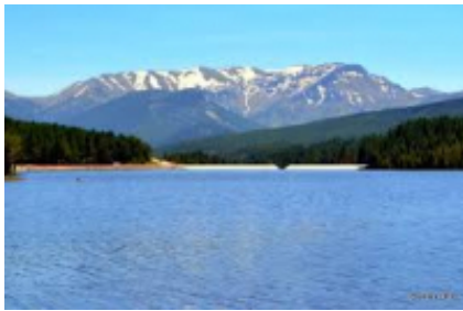
2 - Distretto di Fethiye - Elmalı - 150