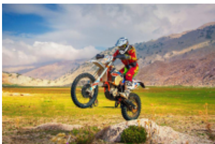
6 - Kaş - Saklıkent National Park - 150