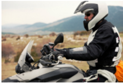
2 - Nauplia - Atene - 170