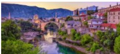
5 - Sarajevo - Mostar - 270