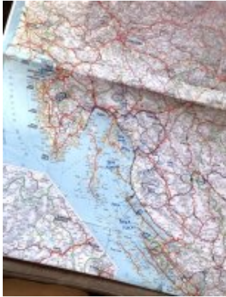
8 - Curzola - Spalato - 105