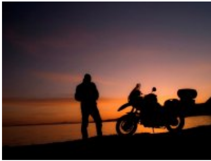
2 - Spalato - Lesina - 75