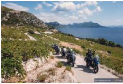
9 - Spalato - Spalato - 0