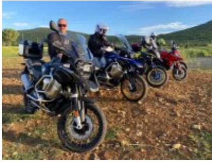
1 - Spalato - Lesina - 100