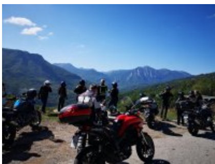
4 - Parco naturale di Blidinje - Sarajevo - 210