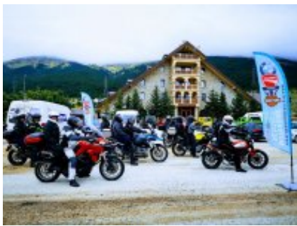
3 - Spalato - Parco naturale di Blidinje - 250