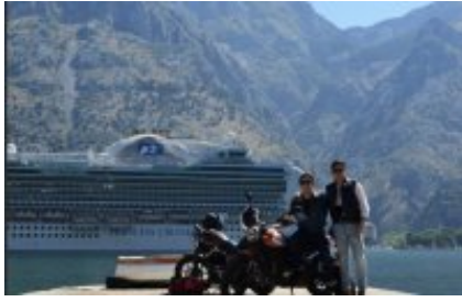
7 - Ragusa - Sabbioncello - 130