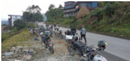
3 - Pokhara - Kalopani - 110