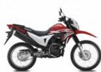
XR 190 + $0.00