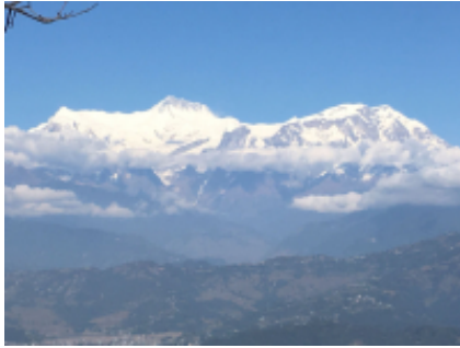
2 - Katmandu - Pokhara - 202