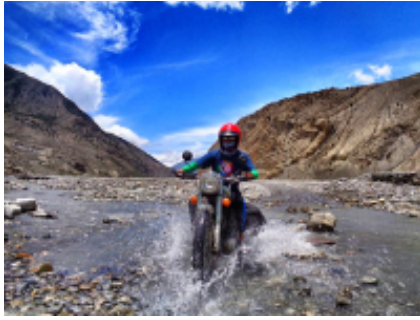
1 - Katmandu - Katmandu - 0