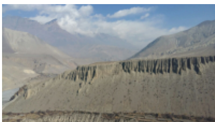
6 - Tatopani - Pokhara - 91