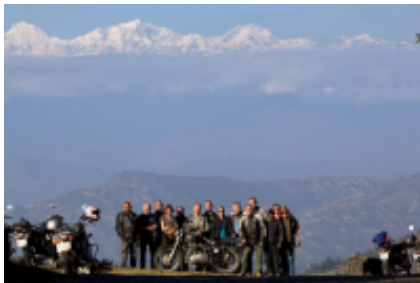
4 - Kalopani - Muktinath - 70