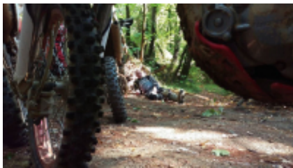
8 - Kardamyli - Atene - 0