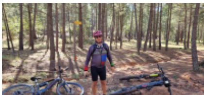
5 - Mora de Rubielos - Villel - 64