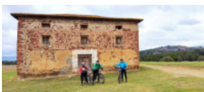
7 - Albarracín - Teruel - 37