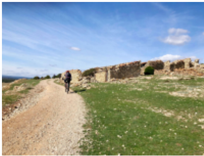
2 - Teruel - Alcalá de la Selva - 60