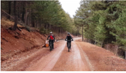
8 - Teruel - Barcellona - 0