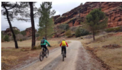
4 - Mosqueruela - Mora de Rubielos - 67