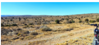
6 - Villel - Albarracín - 56