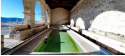
9 - Barcellona - Barcellona - 0