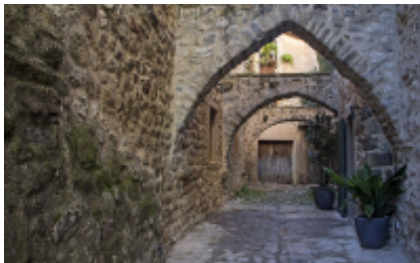
4 - Besalú - Banyoles - 36