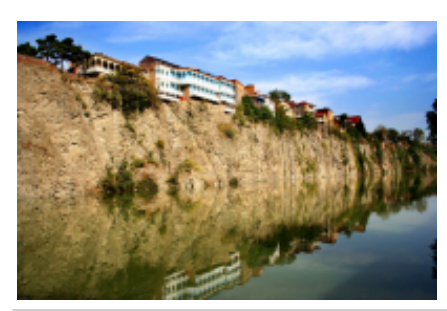
10 - Tbilisi - Tbilisi - 0