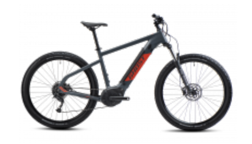
KATO + 0.00.-