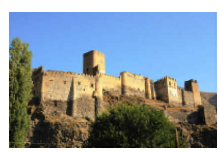
9 - - Tbilisi - 18

8 - Municipalità di Telavi - Municipalità di Kvareli - 43