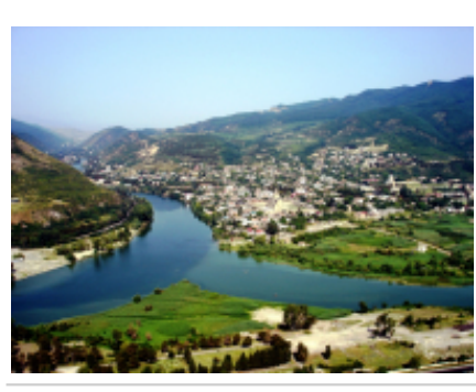
6 - Akhalkalaki - Tbilisi - 77