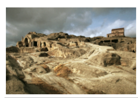
4 - Akhaltsikhe - Vardzia - 63