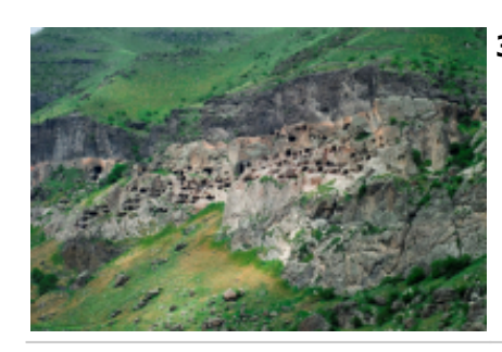
3 - Tbilisi - Akhaltsikhe - 61