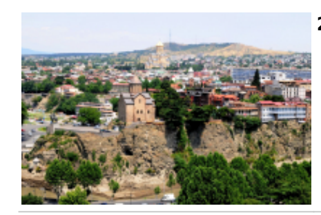
2 - Tbilisi - Tbilisi - 0