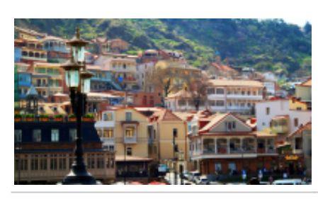
1 - Tbilisi - Tbilisi - 0