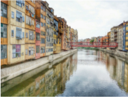
1 - Girona - Girona - 0