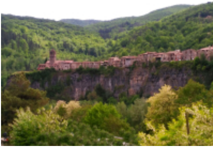
3 - Les Preses - Olot - 41