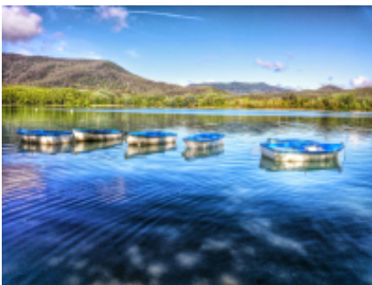
5 - Besalú - Banyoles - 36