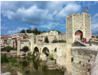
4 - Olot - Besalú - 44