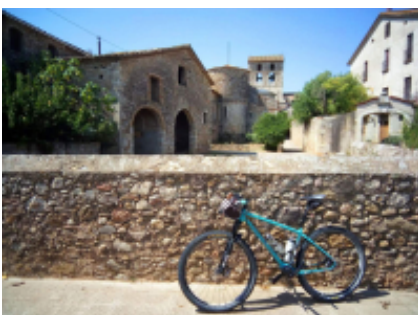
6 - Banyoles - Girona - 31