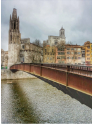
7 - Girona - Girona - 0