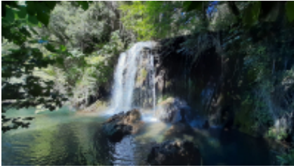
2 - Girona - Les Preses - 60