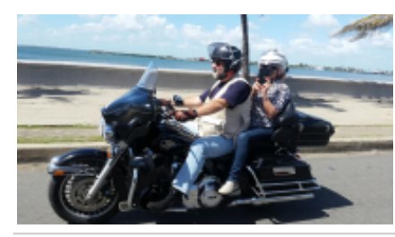
9 - Varadero - L'Avana - 220