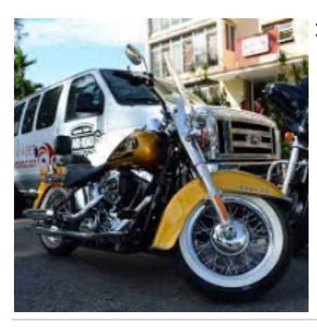
1 - L'Avana - L'Avana - 0