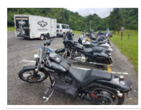
2 - L'Avana - Las Terrazas - 110