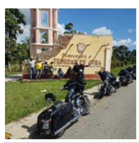
10 - L'Avana - L'Avana - 0