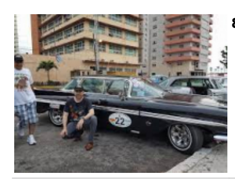
8 - Varadero - Varadero - 150