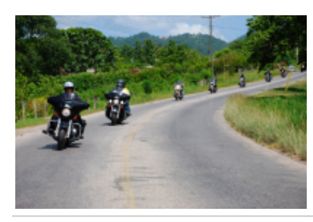
3 - Las Terrazas - Las Terrazas - 180