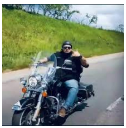
5 - Cienfuegos - Trinidad - 80