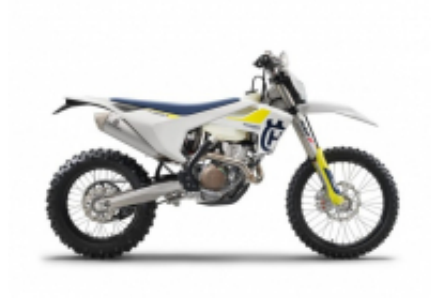
TE 350 + $0.00