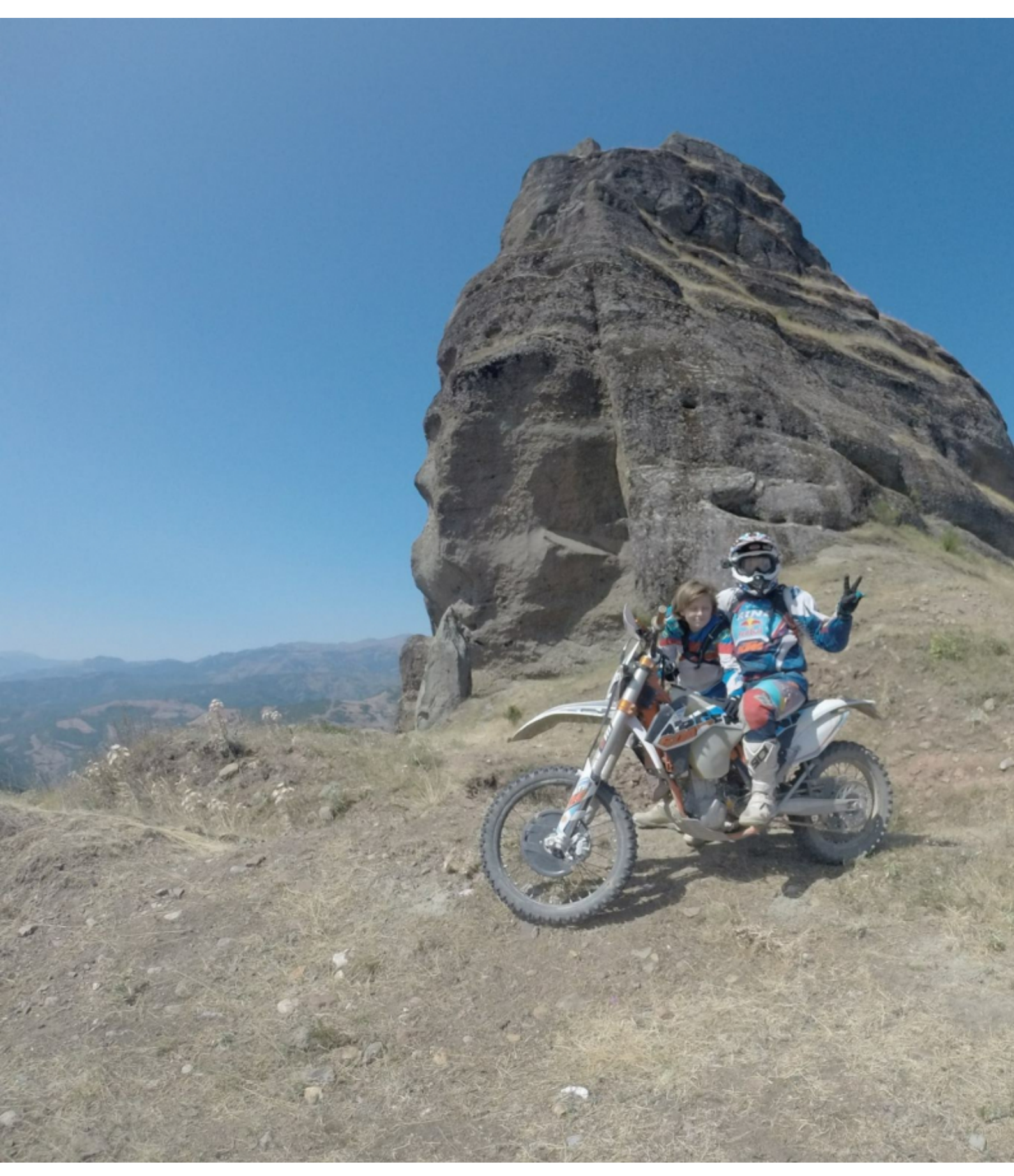
Motorcycle Enduro off Road tour Albania