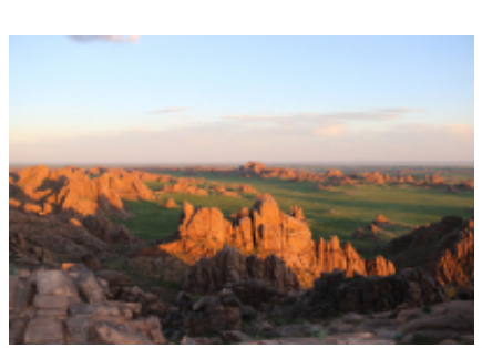
6 - Khongoriin Els - Bayanzag - Ride to Bayanzag and the Flaming Cliffs where many dinosaur remains have been found.