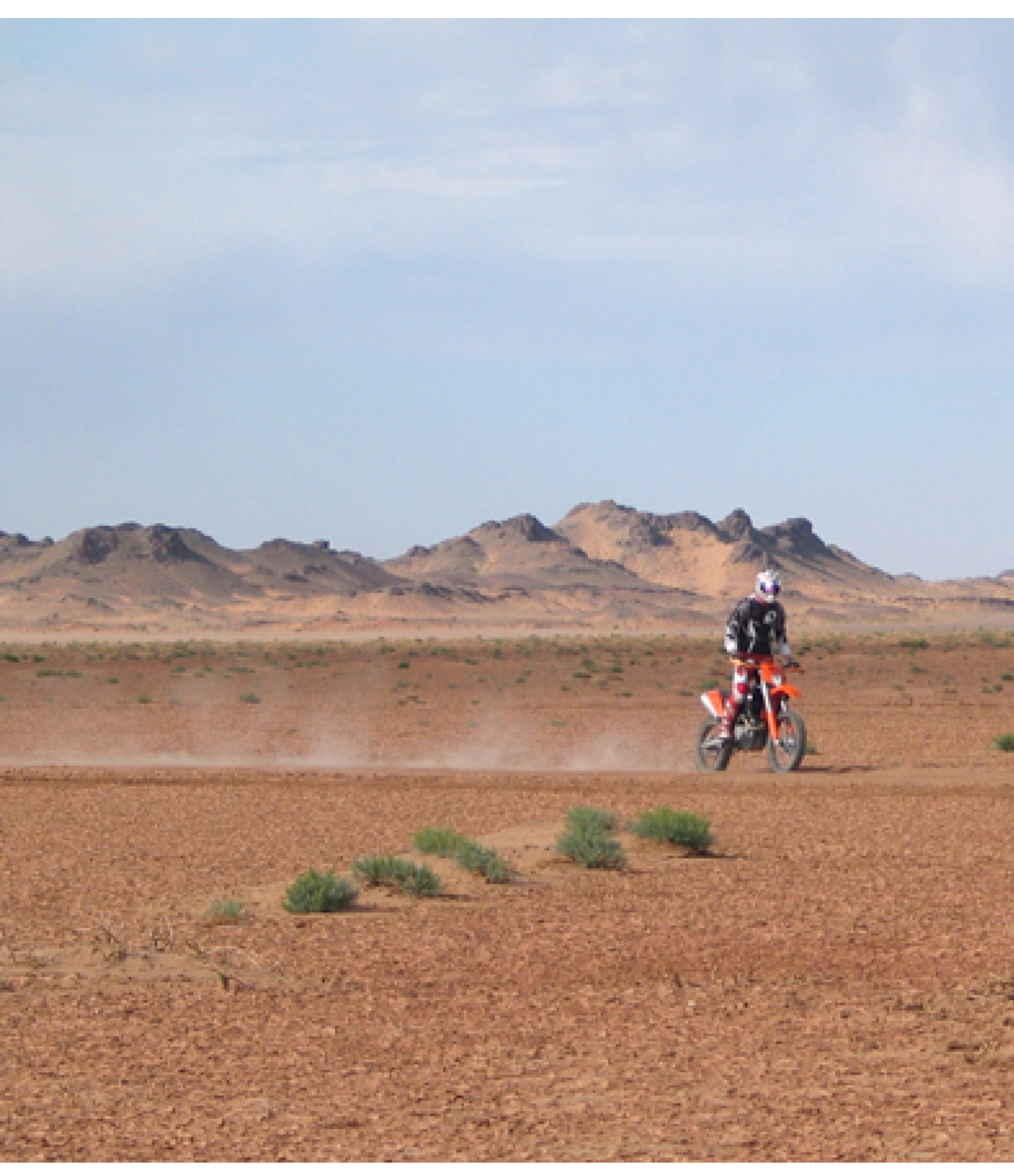
Motorcycle Enduro off Road tour Mongolia Gobi desert