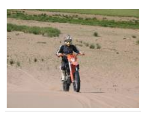
1 - - Ulaanbaatar - Arrive Ulaanbaatar.