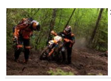
1 - - Sibiu - 0