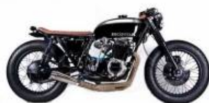
CB 500 Cafe Racer + $0.00