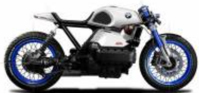
K75 Cafe Racer + $0.00