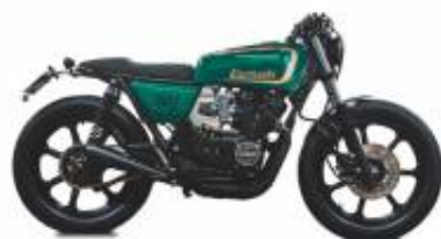
KZ550 Caferacer + $331.78