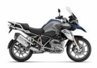
R 1200 GS + $272.48