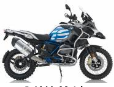
R 1200 GS Adv + $272.48