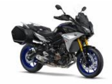
MT 09 847 + $489.01