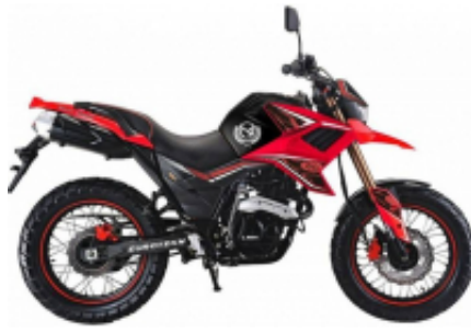
Fuego Tekken 250 + $0.00