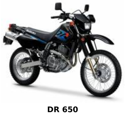
DR 650 + $0.00